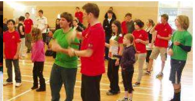
Gang Show Rehearsal