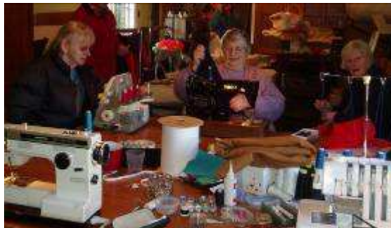
Gang Show seamstresses working hard preparing costumes