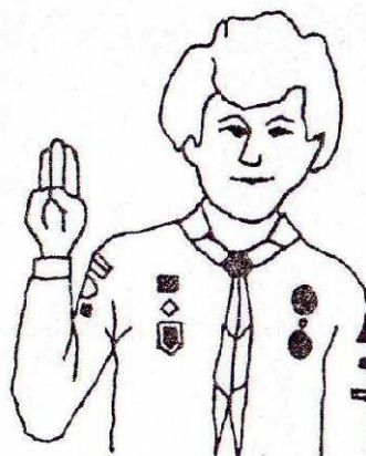
THE SCOUT SIGN